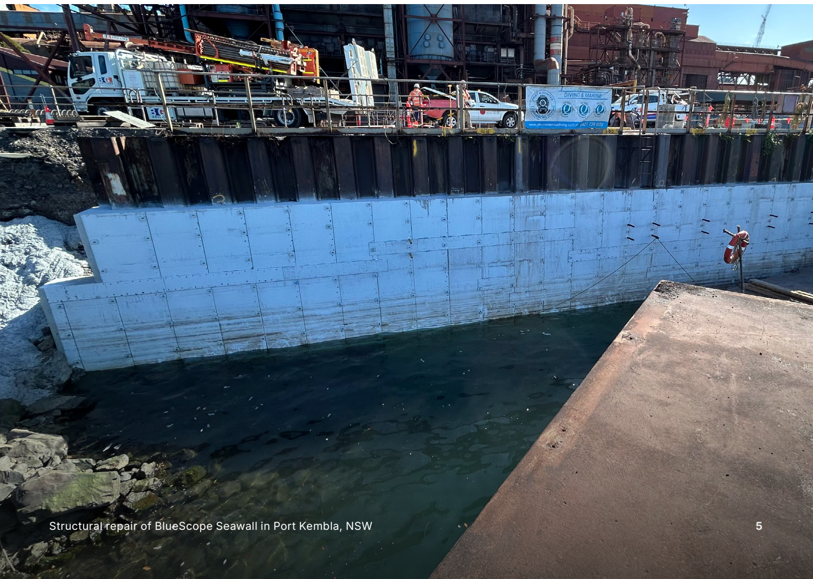
Structural repair of BlueScope Seawall in Port Kembla, NSW

This unique combination of practical experience and technical knowledge is how Hychem Infrastructure delivers success for your critical infrastructure assets; not only today, but well into the future.